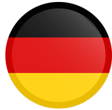
Germany (3.6m 1 )